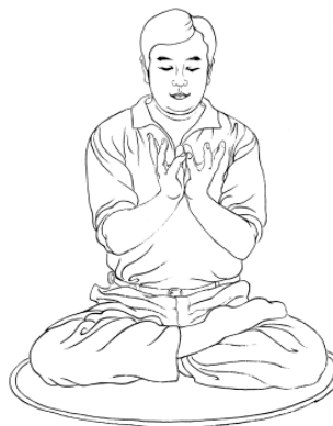
The Lotus Hand Position

fah jung chyen kwuhn shyeh uh! chwen myeh