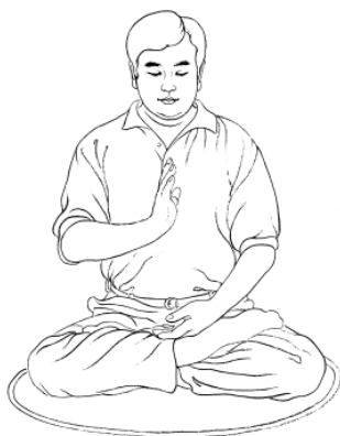
Holding One Palm Erect